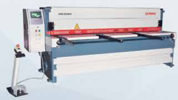
POWER OPERATED SHEAR