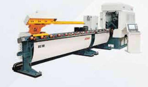
L ANGLE PROCESSING CENTER