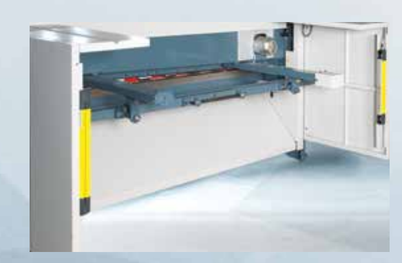
Curtain Light Guards