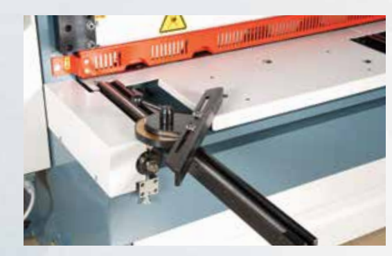
Adjustable Angle Stop 0-180° Finger Guard Ball Transfer Table Hold Downs with Rubber

Backlash-free operation high torques at operating cycles Maintanence free