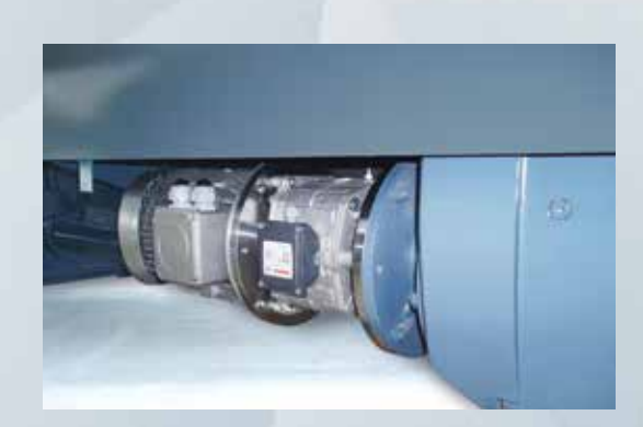
DURMA magnet brakes and clutch system is for

your starting, stopping, positioning, controlling and regulating requirements.