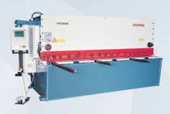
VARIABLE RAKE SHEAR